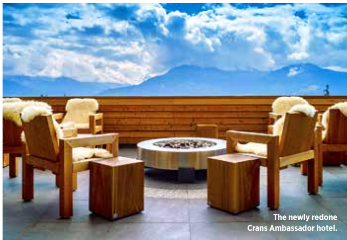
The newly redone Crans Ambassador hotel.

Skiing in and out is only part of the appeal of the Crans Ambassador , Switzerland's retro-chic resort in the Crans-Montana ski area. After a six-year renovation, most of the A-frame hotel's 60 rooms now overlook the peaks of the Valais Alps; the spa has a hammam and an indoor pool. Après-ski, guests huddle around the fireplace at Bar Lounge 180°, where glasses of Valais whites are paired with stories of the day's Alpine adventures. cransambassador.ch; doubles from $440 per night —A.H.G.