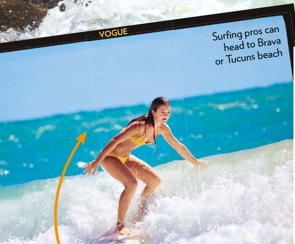
Surfing pros can head to Brava or Tucuns beach